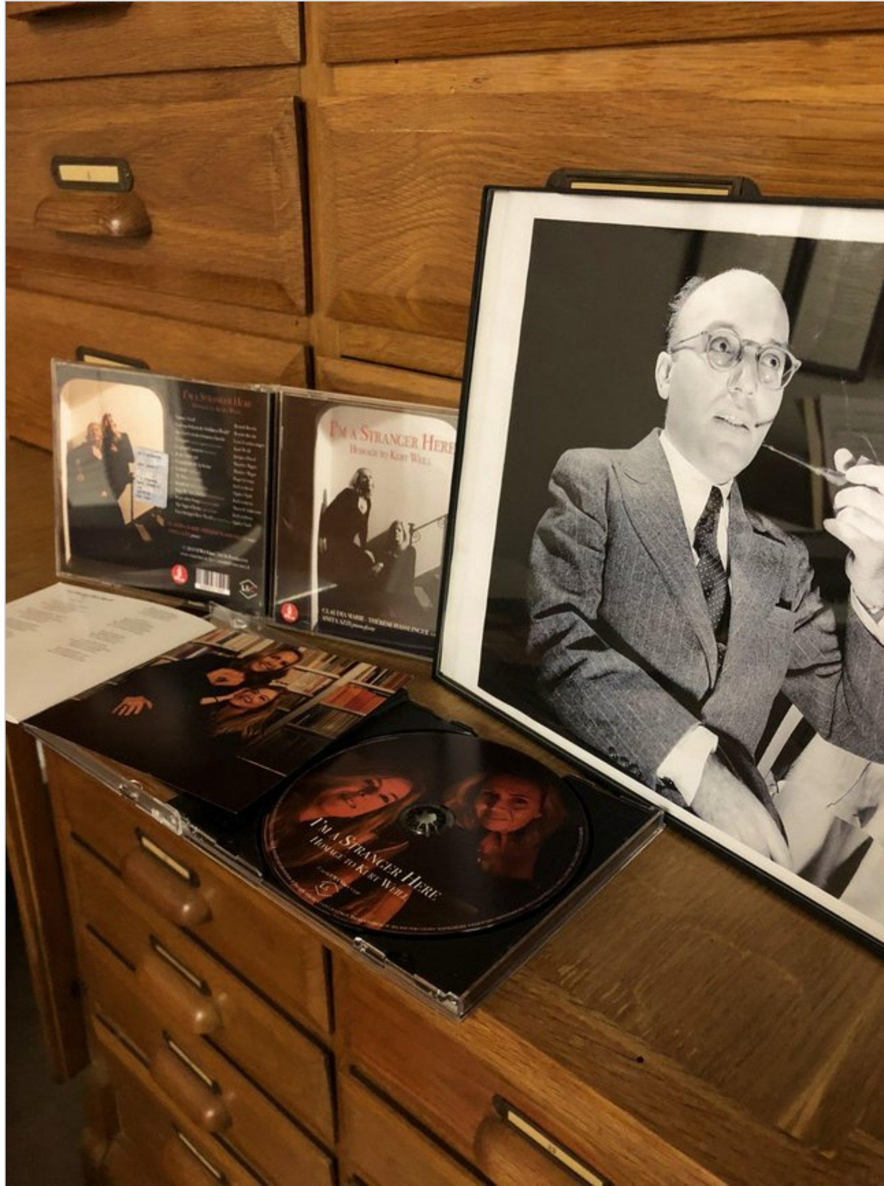
In the photo above: The Kurt Weill CD at the ICAMus Studio.